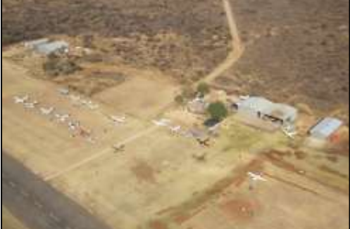
Early morning at Warmbaths